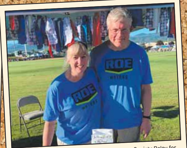
Roe Motors has sponsored an American Cancer Society Relay for Life Lacing Up for Life team for the past ten years. The dealership, employees, customers and friends contributed over $11,000 in 2018 to help the fight against cancer.