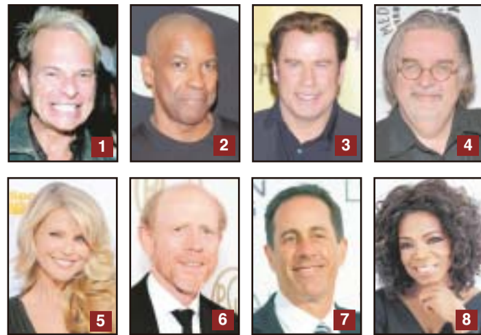
1) rock singer David Lee Roth, Oct. 10; 2) actor Denzel Washington, Dec. 28; 3) actor John Travolta, Feb. 18; 4) "The Simpsons" cartoonist Matt Groening, Feb. 15; 5) model Christie Brinkley, Feb. 2; 6) actor-director Ron Howard, March 1; 7) comedian Jerry Seinfeld, April 29; 8) TV talk show host Oprah Winfrey, Jan. 29.