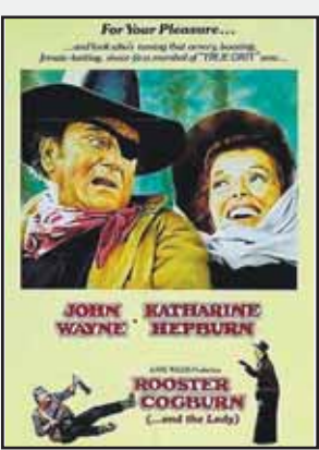
'Rooster Cogburn' was a 1975 movie shot locally that starred John Wayne and Katharine Hepburn.