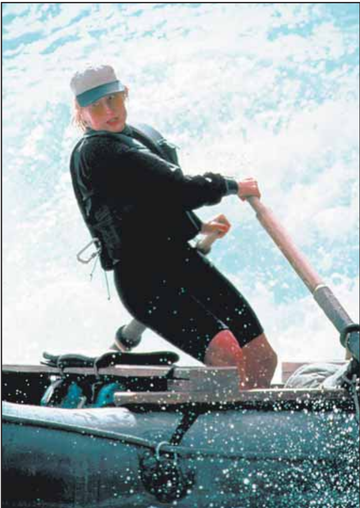
Actress Meryl Streep received a Golden Globe and a Screen Actors Guild best actress nomination for her work on "The River Wild," a 1994 movie that featured several scenes shot on the Rogue River.