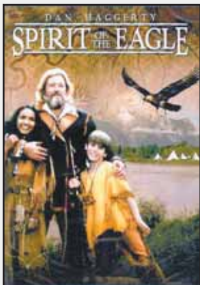
"The Spirit of the Eagle," starring Dan Haggerty, was filmed here in 1991.

The Rogue River also has served as a backdrop for some of Hollywood's most recognizable stars, including Meryl Streep, John Wayne, Katharine Hepburn, Johnny Depp, Kevin Bacon and more.