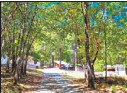
1905 Southside Road

Get away from it all on this wooded 30 acres. Access to BLM on portion of the property; for hiking and exploring. Manufactured home with stick built add on. Primary bedroom and bath with soaking tub and separate shower. Living and family room; wood stove and office. Potential for 2 more bedrooms with add on. Manufactured single wide guest area with add on; 1 bedroom, 1 bath. Own electrical panel. Chicken coup. Numerous outbuildings for storage. Well flow from 2022 was average of 11.4 GPM. $325,000