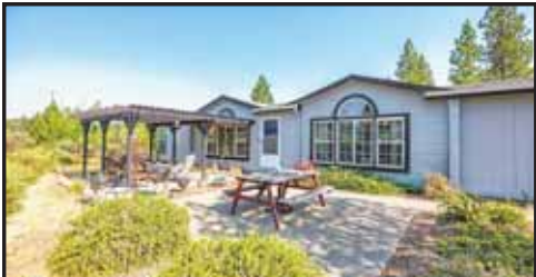
4677 Williams Highway

friends, vaulted ceiling. Covered patio, storage sheds and carport. Newer roof and HVAC. Sweet Hardship/ADU is 1,096 sf with 3 bedrooms, 2 bath and split bedroom floorplan. Relax on the front deck. Own septic and power meter. Close to shopping and hospital. $549,000